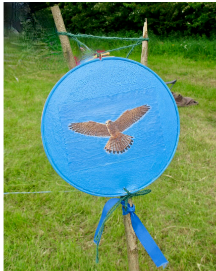
Diagram 2 An example of an Eagle Dance shield. You can use an embroidery hoop with a leather covering, painted with acrylics

Must be worn by all dancers, male and female. You can choose the colour!